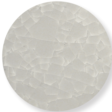
KI-11 Snow Drift