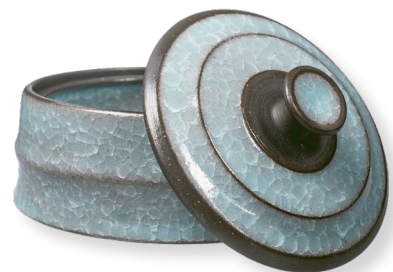
KI-27 Glacial Lake over AMACO Dark Chocolate No.32 clay. Fired to cone 6.