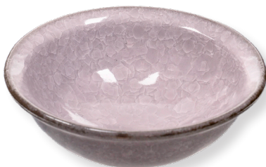
KI-18 Arctic Blush over AMACO Dark Chocolate No.32 clay. Fired to cone 6.