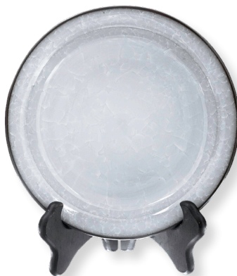
KI-11 Snow Drift over AMACO Dark Chocolate No.32 clay. Fired to cone 6.