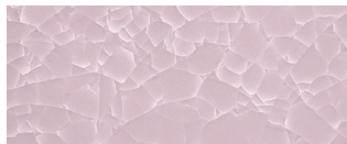
KI-18 Arctic Blush on AMACO Dark Chocolate No.32 clay

Brown or buff clays that do not contain manganese work best with these glazes (try AMACO 30M, AMACO 32M, or AMACO 46M). Testing the clay and glaze to determine compatibility is crucial. White clays can be used, but we recommend putting a thin layer of brown AMACO Velvet Underglazes like V-314 or V-366 down first to achieve the same visual contrast as Kiln Ice on dark clays.