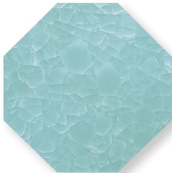
KI-27 Glacial Lake