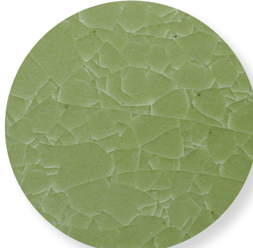
KI-46 Frozen Fern