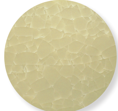
KI-68 Honey Crystal