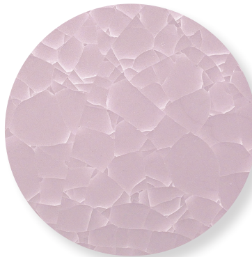
KI-18 Arctic Blush